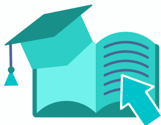
The Breaking Weight Bias training course