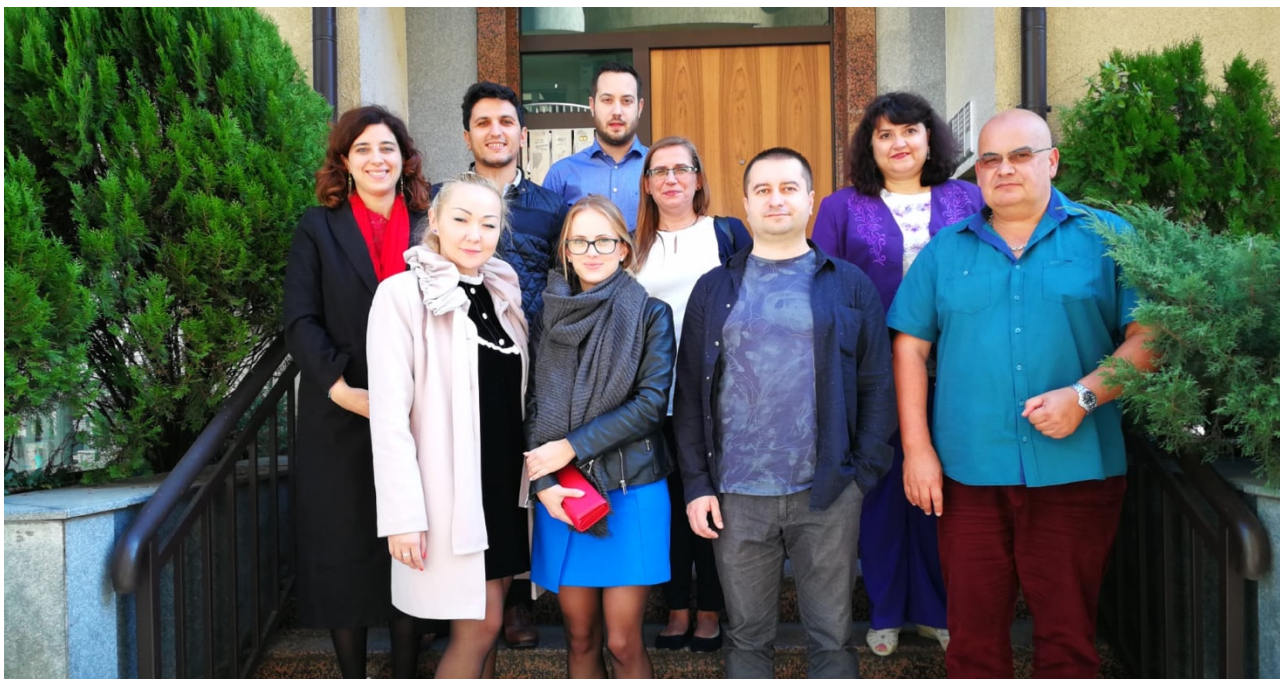
This is the partnership of the BI - NEW project that will work to develop the next phases related to the Mental Arithmetic.

The meeting has given the partners the occasion to present their organisations, discussing about the tasks and their distribution among partners. Furthermore, partners have been trained on the use of Admin Project, the platform which is used for the management of the project tasks, results and activities. Important topic of discussion has also been the dissemination plan for the proper recognition, demonstration and implementation of the project's results. The project's results will be disseminated extensively through a wide range of tools and dissemination activities, in order to assure the efficient impact of the project's results on the society.