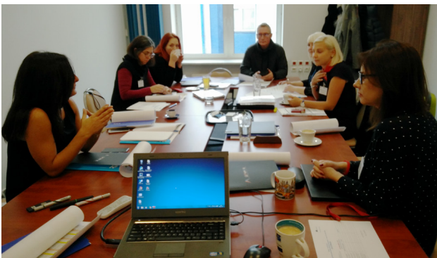
Partners during kick-off meeting.